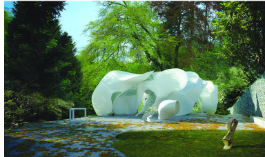
Figure 2. Optimal Design, The Seroussi Contest

Other fundamental results regard the adaptation of statistical learning theory tools to evolutionary optimization. Specifically, Monte Carlo Markov Chains were used for proving the convergence of Evolution Strategies (ES) and analysing their convergence rate. Other results regard the optimization of computationally expensive functions or the use of quasi-random algorithms. The robustness of ES compared to standard, Newton-based approaches in convex settings with high condition number has been demonstrated experimentally.