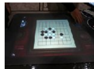
Figure 3. Left: The Huygens computer. Middle: games in Taiwan. Right: Interactive table.